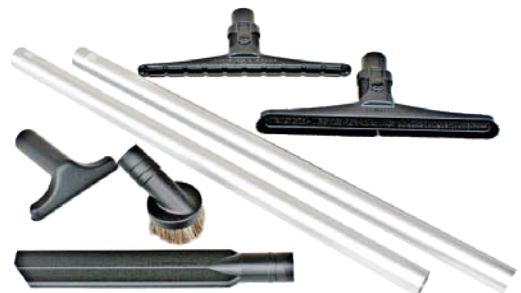
Sidewinder 7-Piece Tool Kit 54" 2-Piece Aluminum Wand, 15" Scalloped Floor Tool, 15" Nylon Floor Tool, 15" Crevice Tool, 3" Round Brush Natural Fibers, 5" Upholstery Tool