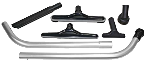
Standard S-Bend 7-Piece Tool Kit 54" 2-Piece S-Bend Aluminum Wand, 15" Scalloped Floor Tool, 15" Nylon Floor Tool, 3" Natural Fiber Dusting Brush, 5" Upholstery Tool, 15" Crevice Tool